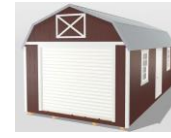
Lofted Barn Garage includes 1 8ft wide rollup door, 1-3ft wooden door and 2- windows