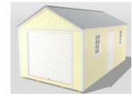
LOFTED Garage Shed includes 1 8ft wide rollup door, 1-3ft wooden door and 2- windows