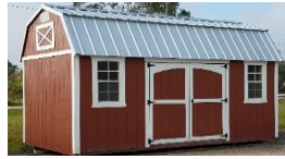
SIDE Lofted barn - our flagship model. For beauty, detail & the country look!