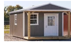
Cabin Shed -Exciting storage 10&12ft Incl. 9 lite door & 3 windows; 8ft incl 1-door & 1 window