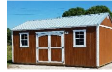
SIDE Gable LOFTED Shed Quality! Double swinging doors - 6ft wide and 2 windows