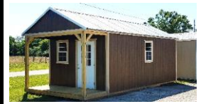
Cabin LOFTED Shed - Like cabin except Steeper roof and loft - Incl. 9 lite door & 3 windows