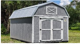
Lofted barn is unmatched beauty,detail and the country look!