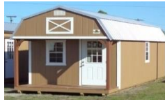
Cabin Lofted Barn with a porch to touch up your storage solution. Incl. 9 lite door and 3 windows