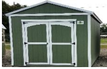
Gable Shed with highest headroom. Swinging doors - 8ft shed gets 4ft, 10, 12, 14 & 16 wide 6ft