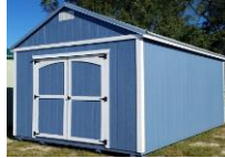
Gable LOFTED Shed Quality! Double swinging doors - 6ft wide