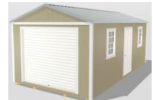
Garage Shed includes 1 8ft wide rollup door, 1-3ft wooden door and 2- windows