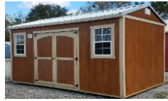
SIDE Gable Shed with highest headroom. Quality! 6ft door and 2 windows